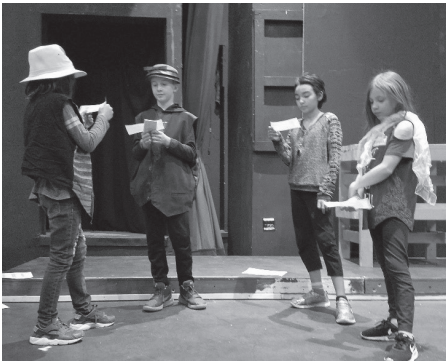
Little Players Children's Workshop

L ittle Players Children's Theatre started out last year undertaking Shakespeare in the third to fifth grade workshop. Twenty students learned about Shakespeare's life and four of his most famous plays: "Macbeth," "A Midsummer's Night Dream," "Hamlet" and "Romeo and Juliet." The students all learned the "To be or not to be" scene from "Hamlet," learned medieval language and insults, and did skits with costumes in preparation to perform a condensed version of "Macbeth" for their family and friends.