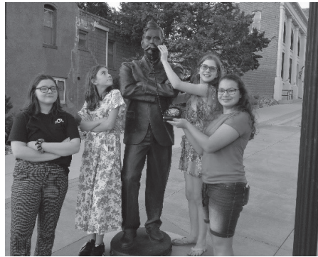
Middle School Drama Club

Keeping with a theme of biographies, the kindergarten to second grade workshop was "Theater on the Prairie." Of the 13 students, 11 were new to Little Players. They learned about Laura Ingalls Wilder and toured the Grand Opera House. Improv games taught them about the theater and developed their acting skills. The students acted out one of the stories from the books, "Dance at Grandpa's (Little House Prequel)" for friends and family.